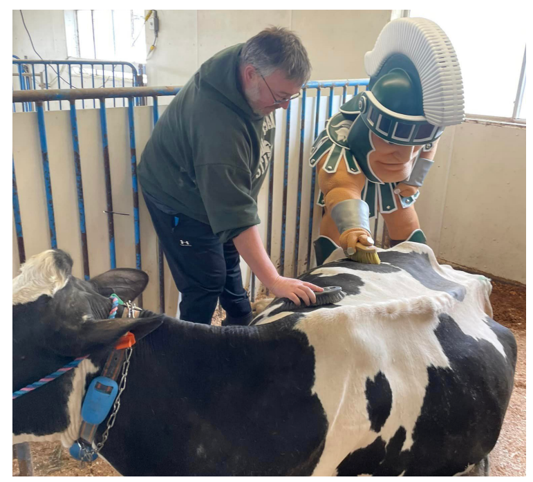
Sparty made a stop at the Dairy Research and Teaching Facility in April for a community de-stressing event.